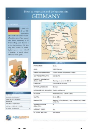
Negotiation and Etiquette in Germany