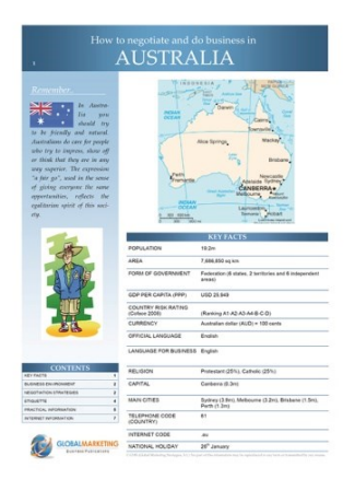
Negotiation and Etiquette in Australia