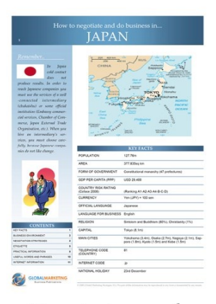
Negotiation and Etiquette in Japan