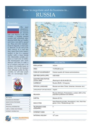
Negotiation and Etiquette in Russia