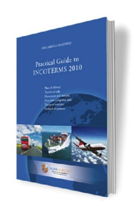
Practical Guide to Incoterms 2010