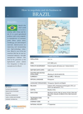
Negotiation and Etiquette in Brazil