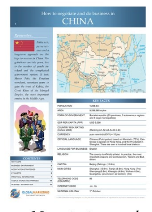
Negotiation and Etiquette in China