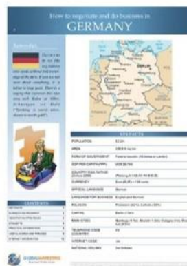
Negotiation and Etiquette in Germany