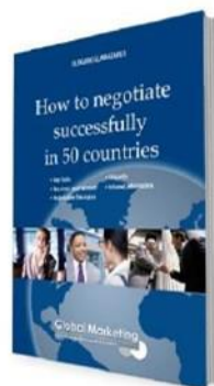
How to negotiate successfully in 50 countries