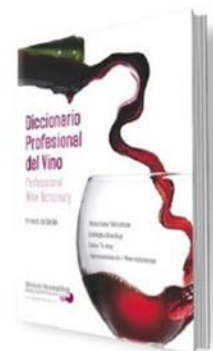
Professional Wine Dictionary

Buy Online www.globalnegotiator.com marketing@globalmarketing.es