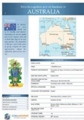
Negotiation and Etiquette in Australia