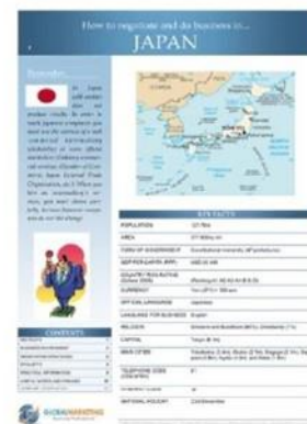
Negotiation and Etiquette in Japan