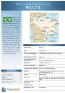
Negotiation and Etiquette in Brazil