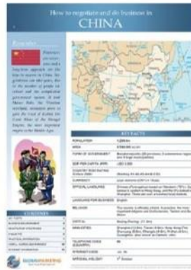
Negotiation and Etiquette in China