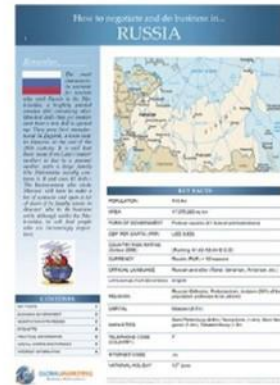
Negotiation and Etiquette in Russia